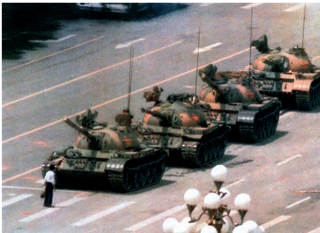
A photograph of tanks in Tiananmen Square, Beijing, June 1989.

16 Look at the photograph, and then answer the questions which follow.