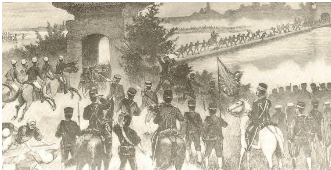
A painting of Japanese troops capturing Pyongyang in Korea during the war with China in 1894–5.