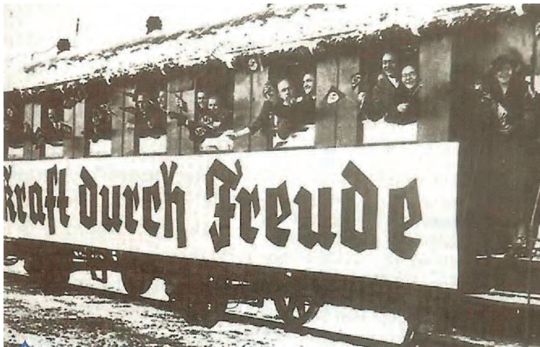
A photograph of German workers on a trip organised by the 'Strength Through Joy' movement.

10 Look at the photograph, and then answer the questions which follow.