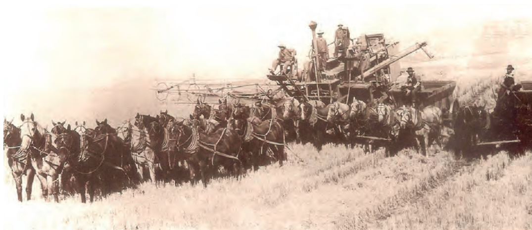
A photograph of recently introduced harvesting machinery on a farm in 1923.