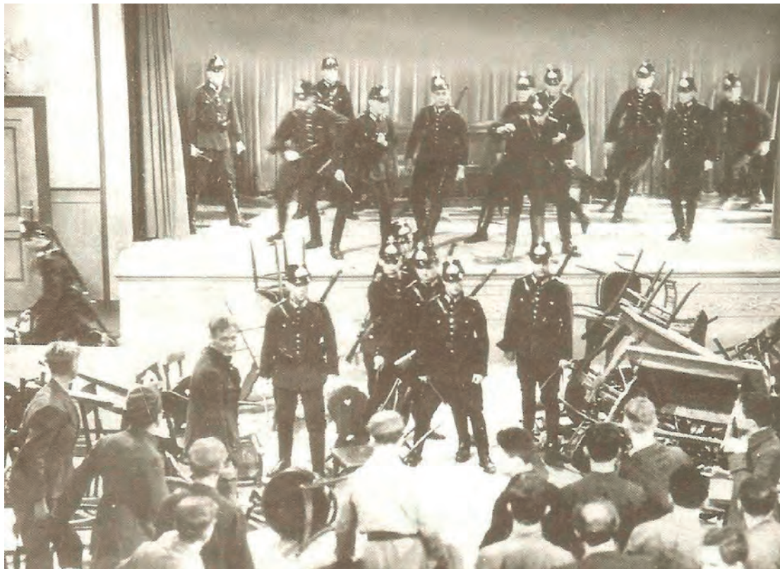
A photograph of the police dealing with the aftermath of a fight between the SA and the Communists, 1932.